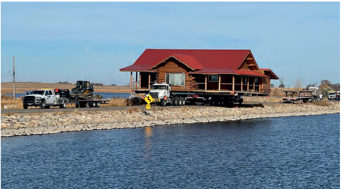
A home is moved due to flooding near Waubay, S.D.

Moving a structure can be an exciting process if done correctly. It’s saving a piece of history from destruction or putting in something new without the headache of waiting. Whatever the reason behind the move, the ability to do it is astounding. Homes can be saved, history can be preserved, and future options are made more available.