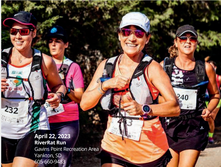
April 22, 2023 RiverRat Run Gavins Point Recreation Area Yankton, SD 605-660-9483

To have your event listed on this page, send complete information, including date, event, place and contact to your local electric cooperative. Include your name, address and daytime telephone number. Information must be submitted at least eight weeks prior to your event. Please call ahead to confirm date, time and location of event.