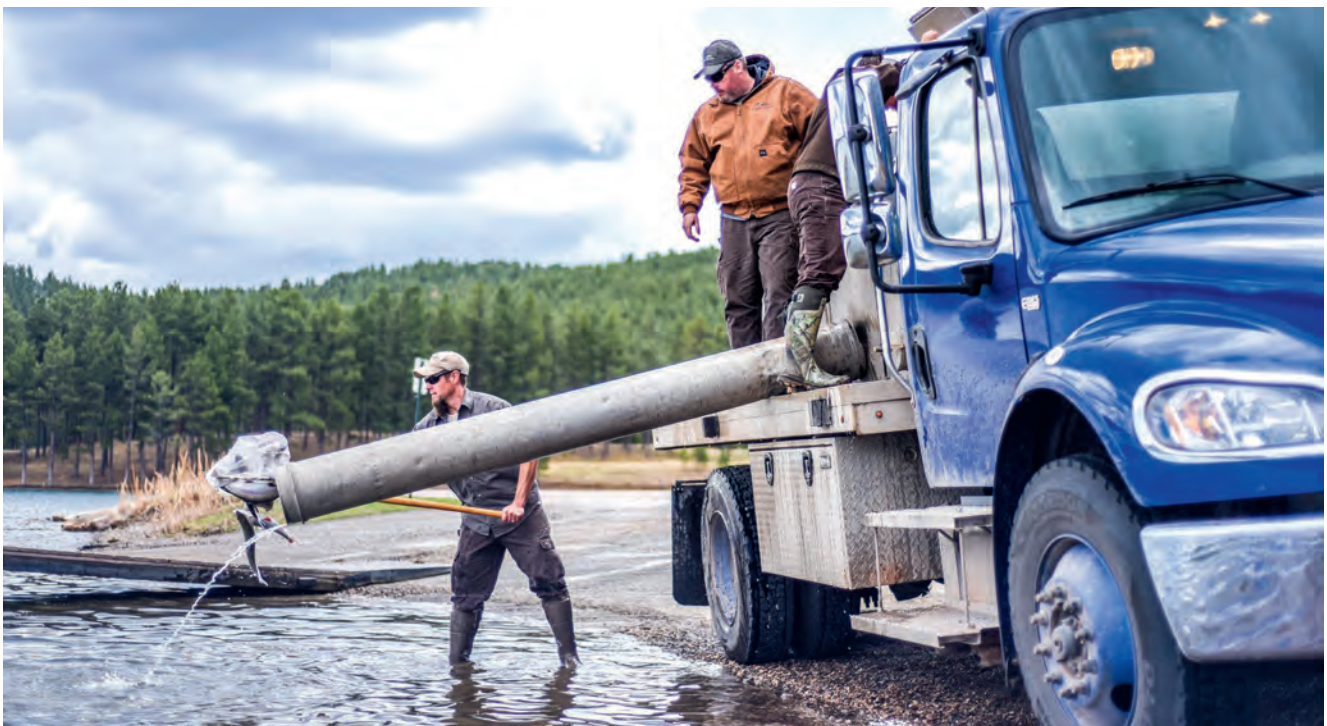
Game, Fish and Parks uses trucks equipped with livewells to stock fish directly into South Dakota fisheries across the state.

"Keep an eye out for new projects because they are happening and underway," he said. "And at the end of the day, it's all about maximizing the satisfaction of our customers, South Dakota's anglers."