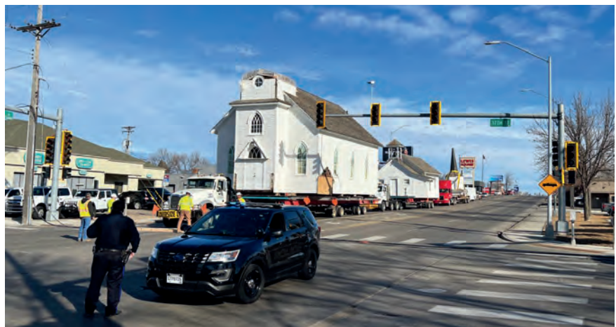
Two buildings are moved from Augustana University campus due to expansion of the college athletics complexes.

"Relocating structures is the world's oldest and largest recycling industry," Wendland stated. "Why people move structures varies greatly, but a few of the most common reasons occur in a